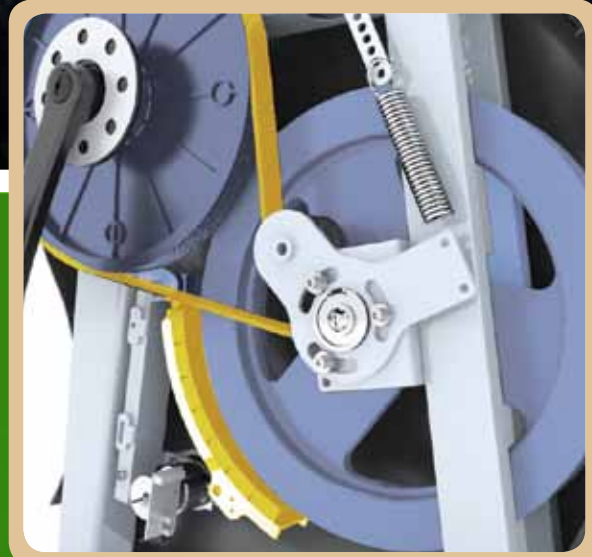
Friction-free magnetic resistance and large Poly-V belts make our bikes exceptionally smooth and quiet.

We build our bikes from the ground up and specify premium parts, such as sealed roller bearings, to ensure top quality. Vision Fitness will not cut corners, which is why we are the leader in the fitness bike industry.