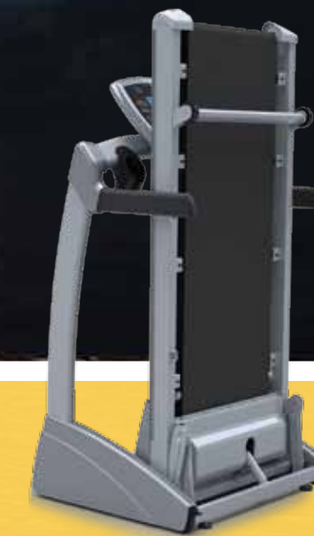
The T9250 and T9550 can be folded to take up less space.

Elastomers provide the support and cushioning that make up a treadmill suspension system. At Vision Fitness, we use elastomers of varying densities to create our “variable cushioning system.” This means that the level of cushioning and support varies throughout the deck, like it does on a quality running shoe.