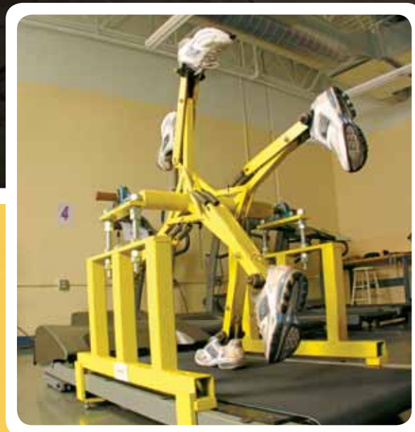
One of the many tools we use to test treadmill life.

We make it simple for you to fit Vision Fitness® treadmills into your home with our space-saving T9250 and T9550 models. Both models fold easily and feature our exclusive “drop assist” system, which helps support the weight as the treadmill deck is lowered and lifted.